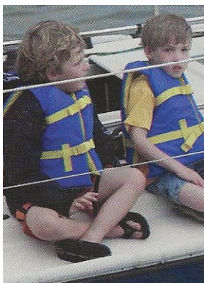
New rules on Life Vests

bor Safety Committee which was inactive for several years. This group consists of approximately 30 members from various boating and navigational interests in the Milwaukee Harbor. The Coast Guard has been making an effort to address recreational boaters needs especially as it pertains to increased boat traffic in the inner harbor and the river.